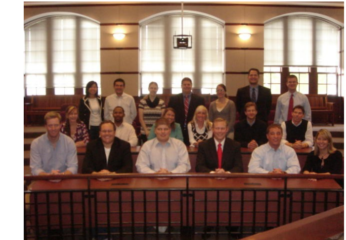
2009-2010 Student Bar Association Officers